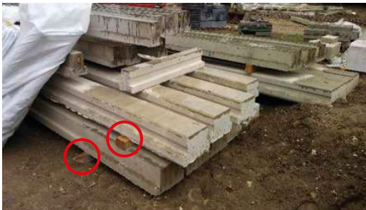
Figure 2 – Poorly stacked beams