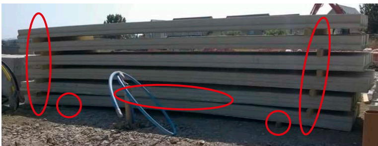
Figure 3 – Poorly stacked beams resulting in severe camber on bottom of stack